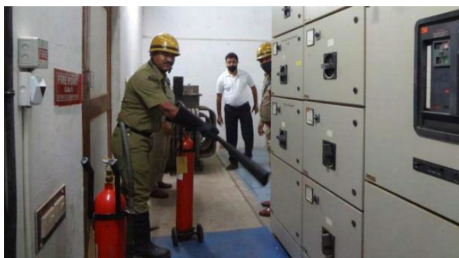
Fire mock drill at magnet power supply unit of Indus-1.

For strengthening the skills of fire personnel as well as employees, four fire mock drills were conducted in technical area like MPS Hall, Indus-1, Beamline-2, Indus-2, 100 kV DC power supply RF Building, and Guard House, etc.