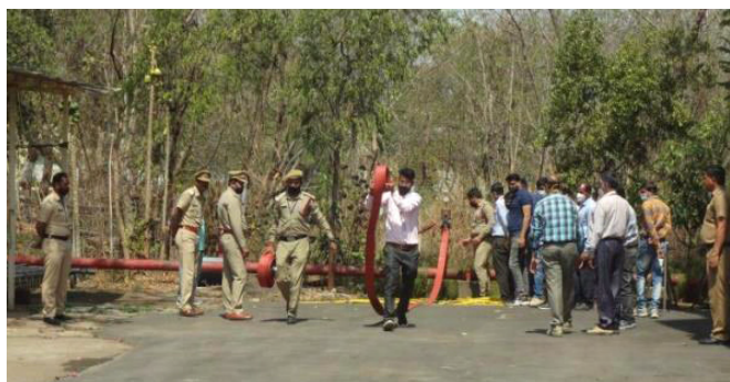
First-aid fire-fighting training program for RRCAT employees.

Safety skills development activities in Fire Section: Fire and Safety Section has been always committed for enhancing safety awareness and skills of RRCAT employees through safety programme and training. To enhance fire-fighting & communication skills for meeting the requirements of any fire emergency, RRCAT employees are regularly being trained in basic fire-fighting and donning & doffing of Breathing Apparatus Set, so that they can survive, secure and save life in worsted fire emergency scenario. During last two quarters of the year, 82 RRCAT employees and 28 TASAR trainees were trained in such first aid fire-fighting training. Along with this, four classes on the subject as “How to conduct mock exercise and roles of security personnel during such exercise” were arranged & conducted by Fire Officers at RRCAT Convention Centre during their OJT program.