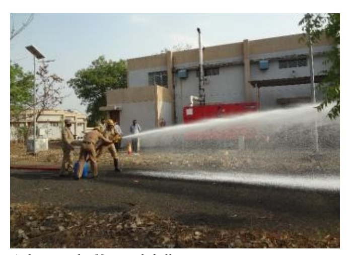
A photograph of fire mock drill.

Fire and Safety Cell is regularly conducting safety awareness and skill enhancement program for the crew members and also for RRCAT employees. In spite of COVID-19 pandemic, 85 RRCAT employees were trained in first aid fire-fighting training following COVID-19 protocol. Further, two fire mock drill were also conducted at RRCAT Central Complex substation (diesel generator sets) and oil storage yard of IRSU.