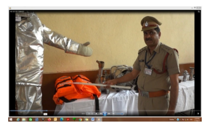
Online fire fighting demonstration for National Science Day-2021 celebration.

For National Science Day-2021 event this year, videos on fire safety awareness and fire demonstrations were shown during the on-line celebration with school / college students and RRCAT employees.