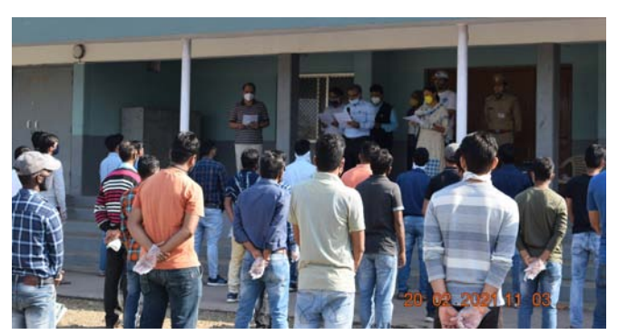
Swachhata pledge being administered to volunteers on February 20, 2021 during Swachhata Pakhwada.

As part of celebration of the "Swachhata Pakhwada-2021", the cleanliness drive for the colony was taken up with enthusiastic participation of the residents of the colony as well as AECS teachers, RRCAT employees, CISF personnel, students and trainees in large numbers. Further, in the two workshops, talks were delivered in Hindi on the broad topic of "Hygiene & cleanliness issues in the current scenario of COVID-19" by the doctors of RRCAT Medical Centre.