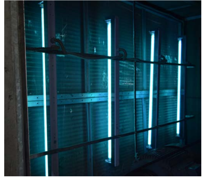
Fig. 1.2.2: Photograph showing germicidal UV-C lamps integrated in AHU at Indus-2 complex.

Figure I.2.2 shows operational AHU-36 commissioned with germicidal UV-C lamps at Indus-2 complex.