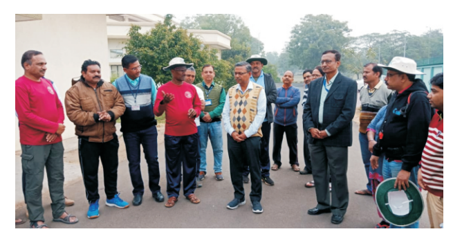
Director, RRCAT (in the middle) interacting with the trek organizers.

Staff Club organized an Annual DAE Trekking Expedition, "Girisanchar-31" during 13th - 24th January 2020 in route Kajaligad – Baigram – Kalakund – Kushalgad – Raskundiya – Deogad - Rosayabari - Mahadeo Khodra - Jam Gate & Wanchoo Point in Vindhyachal range near Indore, Madhya Pradesh. The trail runs mostly in teak forest, valleys, fields situated amid hills, waterfalls and streams of Choral river. The route was picturesque and full of natural beauty. Major attractions of the expedition were Kajaligad, Kushalgad forts, Kalakund heritage train station, Mahadev cave and connecting point of Malwa and Nimar region known as Jam Gate. Six different camp sites were located for the event (Bai Gram, Kalakund, Raskundiya, Rosayabari and Wanchoo Point) with base camp at Lake Side Community Centre, RRCAT Colony. In all 233 participants from 16 different units of DAE reported for the trekking. An outreach activity was also conducted by the volunteers in the nearby villages. It included an interactive session for the local school children and villagers, sky-gazing using telescopes etc.