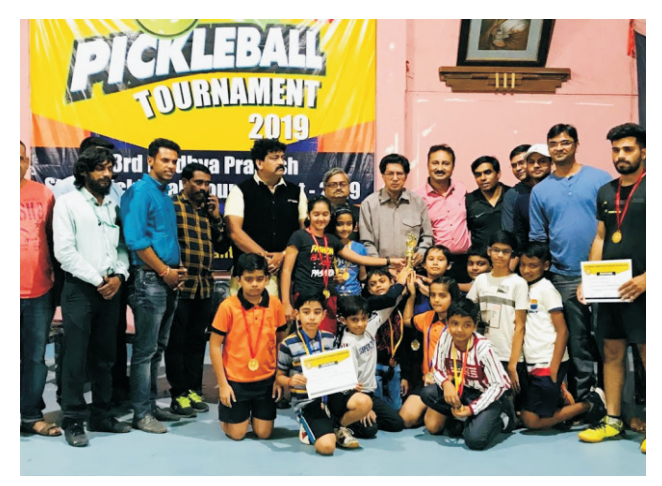
Winners of Pickle Ball overall championship trophy.

Many children of the staff club members participated in 3<sup>rd</sup> M.P. State Pickleball tournament organized at Maharaja Yeshwant Rao School, Indore during 10<sup>th</sup> - 12<sup>th</sup> November 2019 in Sub-Junior category (under 12 years) and Junior category (under 19 years) and won several medals and brought laurels to RRCAT by winning the overall Championship Trophy.