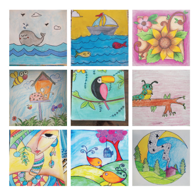
Collage of drawings prepared by wards of RRCAT.

i) Online Summer Classes on Drawing as well as Keyboard were conducted from 20^{\text{th}} April to 19^{\text{th}} May 2020 with \sim 30 nos. of participation in both the activities.