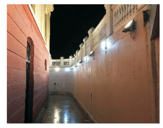
Fig. I.2.6: Retaining wall after renovation.

Entire structural work of retaining wall and waist slab is retrofitted by providing cantilever waist slab supported on newly constructed RCC retaining wall. Figure I.2.6 shows a view of the retaining wall after renovation. The retaining wall is also provided with weep holes to drain out sub soil water from the embankment of road. RCC retaining wall with marble railing similar to the existing pattern is also provided for better aesthetics. Internal electrification work along with lightening arrester have also been carried out in consultation with the State Government authorities.