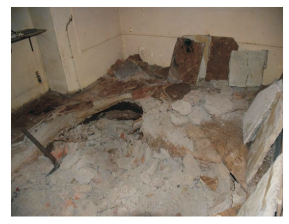
Fig. I.2.2: Damaged hollow floor.

existence of weathered rock layer over hard strata. The load bearing wall of thickness 600 mm did not show any sign of distress, indicating its sound structural health. However the basement floor indicated significant settlement at many places. The trial pits indicated black cotton soil and hollow space below the floor. Thus, it was concluded that black cotton subsoil was subjected to volume changes. The fluctuation of water level in the adjoining lake led to the moisture movement and consequent expansion and contraction of sub base. Due to intense seepage of lake water in the building, the floor started settling, posing great threat to stability of the structure. Figure I.2.2 shows the damaged hollow floor as proof of settling of the floor. In order to arrest seepage, RCC cut off wall is constructed up to the depth necessary for stability of foundation. Incidentally the deepest point of lake is close to the palace, hence the construction of cut off wall under water was challenging. Coffer dam was built to restrict the water flow. Construction and dismantling of coffer dam was also a challenging task.