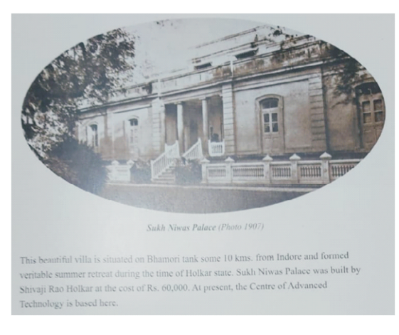
Fig. I.2.1: Sukhniwas Palace (1907).

Sukhniwas Palace in Indore was constructed in the year 1883 by Shivaji Rao Holkar, the famous ruler of the Holkar dynasty. Presently, it is a heritage structure of archeological and historical importance. Figure I.2.1 is a photograph of the Sukhniwas Palace taken in the year 1907. The Palace is leased to RRCAT since its inception in 1984. The Palace building was initially utilized as the office of Director, RRCAT and thereafter as workplace for Laser Target Laboratory. RRCAT has made enormous efforts to preserve the structure as per the archaeological guidelines. Further, to take care of aging of this old structure, intensive renovation work was taken up and completed recently. The Palace was made ready to set up the "Accelerator and Laser Science Museum". Following is a brief description of the old state of the building prior to renovation, challenges faced in renovation and the various civil design principles applied for renovation.