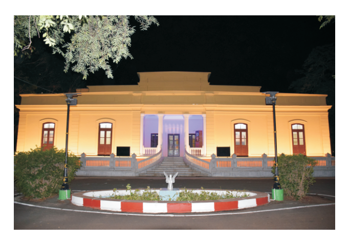
Fig. I.2.7: Palace after complete renovation.

Figure I.2.7 shows the front view of Sukhniwas Palace, after complete renovation. After the completion of renovation work, the authorities of Archeology, Records & Museum Government of Madhya Pradesh have issued a certificate indicating satisfactory completion of the work and asserting its fitness for intended use.