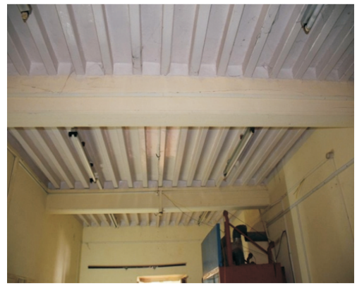
Fig. I.2.4: Deflection of wooden beams.

It was also observed that there is a deflection of the wooden beams as shown in Figure I.2.4. In view of the deteriorated wooden beams, scantlings etc., old available structural steel frame work with old weld mesh is provided on the soffit of roof to increase its stability. Further, in order to restrict the entry of rain water, low height metallic roof is also provided.