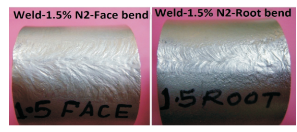
Fig. A.14.2: Guided bend tested GTA welded (shield gas: Ar + 1.5\% N_{\odot} ) 316L SS specimens.

metal and welded specimens, against the minimum LE value, specified by ASME