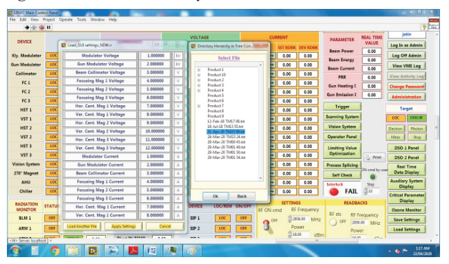
Fig. A.10.2: Main GUI panel of Linac-3 control system.

Machine Safety Interlock System: Operation of the linac facility is associated with the industrial and radiation hazards. Operation with a number of safe conditions, referred as interlocks, is implemented to ensure the safety of the personnel and machine. An independent hardware interlock system is implemented. Some of the subsystems have few local interlocks whereas most of the global interlocks are processed in the interlock system.