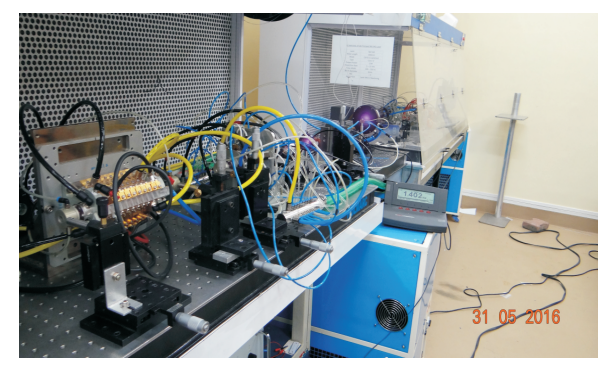
Fig. L.2.2 Photograph of the fibre coupled diode pumped Nd: YAG laser in operation.

This corresponds to an optical to optical efficiency of 33.8% and the measured slope efficiency was 41.9%. Figure L.2.2 shows the photograph of the laser in operation. Output coupler was optimized for maximum optical to optical conversion efficiency at high pump powers. Beam quality (M^2) value for this multiple head resonator was measured for the entire pump power range and it varied from 64 to 92. The output beam at maximum power was coupled to 600 micron core diameter fibre to deliver 1.4 kW output power. Laser power up to 1060 W can be coupled to fibre of 400µm core diameter. Figure L.3.3 shows the output power from the laser and fibre coupling efficiency vs input pump power.