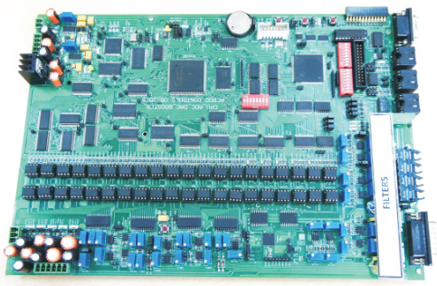
Fig. A.2.2: DSP and FPGA based main circuit board of the controller

Each of the controllers provide basic functions of monitoring of eight status parameters, digital controls of eight parameters, two analog inputs and two bipolar analog reference outputs with 16 bit resolution and stability of \pm 100 ppm. Fig. A.2.2 shows the DSP and FPGA based main circuit board of controller. For energy ramping of electron beam, magnetic fields of all the magnets are ramped synchronously. In the new scheme, reference of ramp profile will be generated synchronously by each of the controllers following a trigger input. Ramp profiles can be independently programmed in the controllers. Fig.A.2.3 shows typical ramp profiles of voltage reference and current reference for dipole power supply generated by this controller.