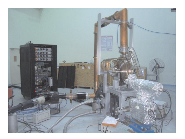
Fig. A.4.2: High power test set up for RF Cavity.

processing was carried out to achieve high surface finish (Ra 0.25 \mu m) and cleanliness on inner surfaces of the cavity, compatible to high RF fields and ultra-high vacuum. No crevice or pockets on the joints was left and all excess silver brazing alloy was removed afterward. The most challenging part of development of RF cavity was conceiving of precision brazing fixtures and process planning for all the four stages. The largest joint (faces of two half shells) of mean diameter 530 mm and 20 mm wide, ten ports with copper to SS transition and Ø70 to Ø203 CF flanges in different orientation, 42 nos. of Ø10 mm cooling tubes were brazed successfully using the precision fixture in the vacuum furnace. Fully fabricated RF cavity is shown in Fig. A.4.1. All joints were leak tested up to of 5x10^{-11} mbar-litre/sec.