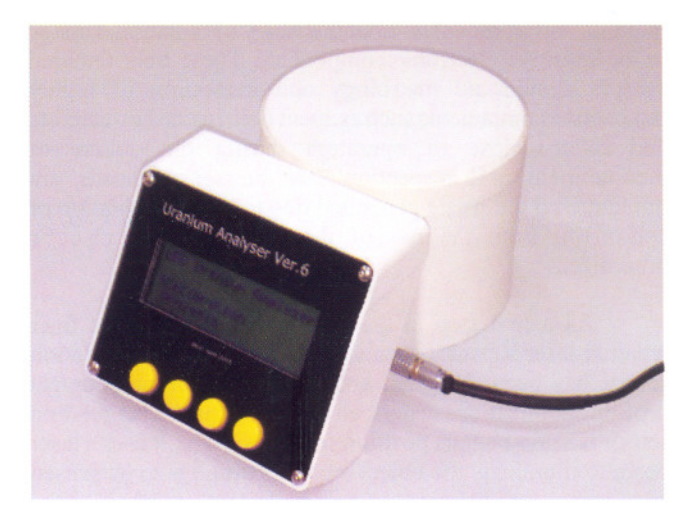
Fig.L.6.2 The Photon counting version of the uranium analyser, technology for which is being transferred to ECIL.

ECIL, Hyderabad had also expressed its desire to take up production of this version of the instrument. A photon counting based Uranium Analyser has been developed with a detection limit of 0.02 ppb and a range of up to 100 ppb which is shown in the Fig. L.6.2. The technology for this instrument is being transferred to ECIL.