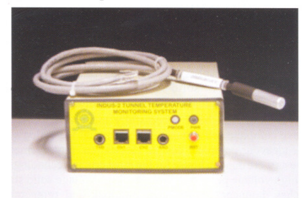
Fig.A.5.2:TTMS controller along with temperature sensor probe

Table A.5.1 highlights the TTMS hardware system features and Fig. A.5.2 shows the TTMS controller and temperature sensor probe.