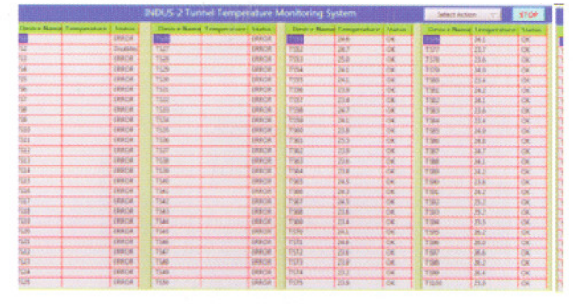
Fig. A.5.3: TTMS softwareGUI

The controller handles the communication with up to one hundred temperature sensors using one wire bus protocol. It collects the temperature data from all the sensors and sends it to SCADA server on receiving commands. It also performs the device handling functions such as device configuration, detection and error reporting. The embedded software for temperature controller is developed using in application programming (IAP) Application Programming Interface (API) to directly update the device ID table in microcontroller memory (ROM) thus facilitating easy replacement of faulty temperature sensorwith the new one and system reconfiguration. The SCADA system for the project is developed in LabVIEW framework with a modular architecture. It comprises of four modules - TTMS server module, GUI module, Data-logger module and Device configuration module. Fig. A.5.3 shows a screenshot of TTMS software GUI.