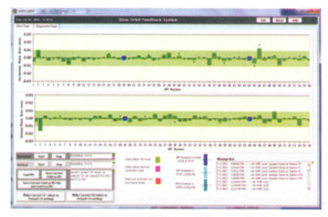
Fig.A.8.3: SOFB Control System GUI

The SOFB control system software comprises of three modules a) PVSS server module b) LabVIEW based client GUI and c) Control Software Module. The PVSS server module implements the functionality for decoding the commands obtained from Lab VIEW based client GUI. The control software module implements reading from BPIs and writing of different parameter values of horizontal and vertical plane slow corrector power supplies under different mode of operations, directly through PVSS Data Points. Figure A.8.3 shows the screenshot of SOFB software GUI.