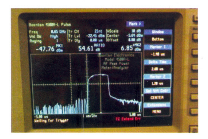
Fig. A.16.2 : Klystron RF output @ 30MW at 2856MHz, on a peak power meter.

Reported by: Purushottam Shrivastava, (purushri@rrcat.gov.in), Y.D. Wanmode and P. Mohania.