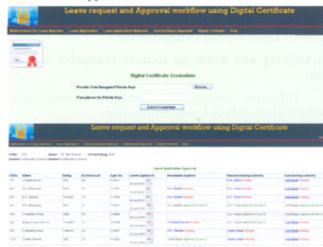
Figure I.2.2: Leave approval using Digital Signature Certificate

Approval of leave/ joining report is done using Digital Signature Certificate (DSC) issued to respective approving authorities by PKI (Public Key Infrastructure) setup created using Oracle Certifying Authority (OCA). After digital approval, the Digital Signature Certificates are stamped in the PDF file at respective places. All the information related to leave application, joining report and approval is maintained in log files.