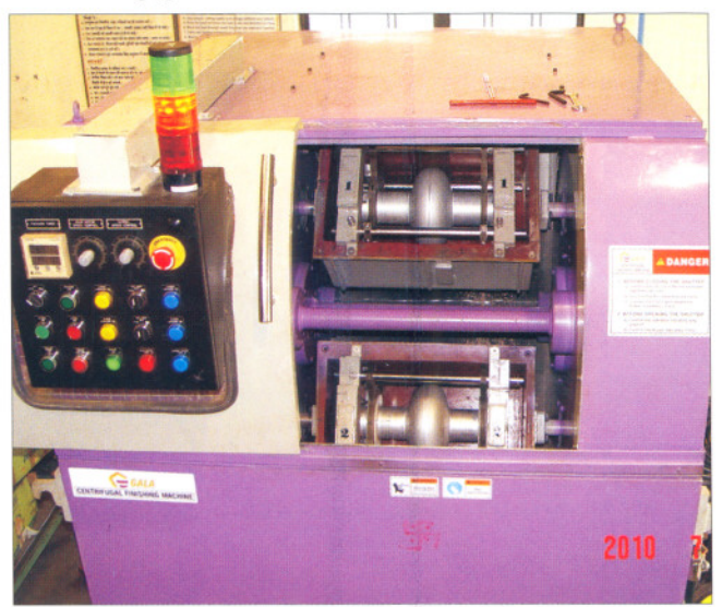
Fig. A.9.1: Barrel polishing machine for Single cell 1.3 GHz SCRF cavity.

Superconducting RF cavities are designed to operate for accelerating gradients of \sim 25\text{-}40 MV/m. The fabrication