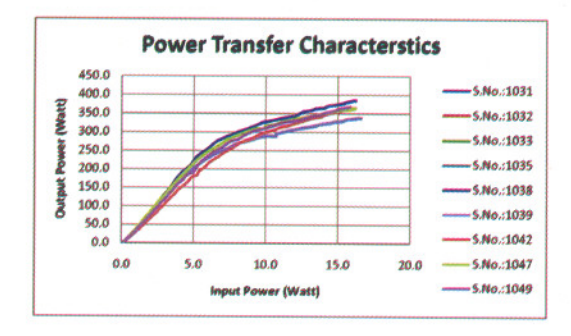
Fig. A.4.2: Measured performance of 300 W amplifier modules at 505.8 MHz

Measured response of 300 W amplifier modules is shown in Fig. A.4.2. Maximum saturated power obtained is in excess of 300 W with saturated gain of 13 dB. Assembled rack has been tested up to 2 kW for more than 30 hours, with each test segment stretching 3-6 hours in time. Wall plug efficiency measured was in excess of 45%.