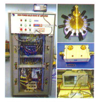
Fig. A.4.3: 4 kW amplifier at 352 MHz showing amplifier, power combiner and directional coupler developed for 1 kW and 4 kW RF power

Encouraged by successful results of 2 kW amplifier at 352 MHz and 505.8 MHz, 4 kW amplifier at 352 MHz (Fig. A.4.3) has been fabricated. At the core of this unit, 16 numbers of 270 W amplifier modules have been power combined using 16-way radial power combiner. This combiner, and low power and high power directional coupler, developed in house, have been used for combining and measurement.