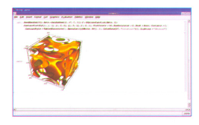
Fig. 1.1.3: Using Mathematica7 from Remote Windows desktop.

Computational and engineering software tool Mathematica has been upgraded to latest version (version 7) with five users network floating licenses. The software tool has been configured on Intel based Linux server. Mathematica version 7 supports built-in Digital Image Processing & Analysis, built-in Parallel Computing, Automated Charting Graphics, Industrial-Strength Boolean Computation, New Number Theory Capabilities, Integer Sequence Analysis, Enhanced Fourier Analysis and various other new features. Three days training with hands-on was also organized for Mathematica users at User Hall, Computer Centre.