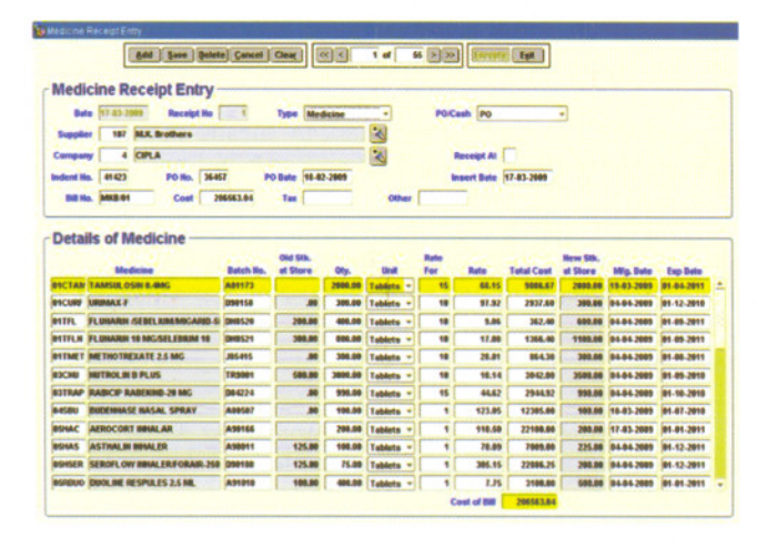
Fig. I.2.1: Snap shot showing entry of received medicines.

Re-structuring of the software and database was done to overcome shortcomings of earlier software. New features were added for annual stock taking and report generation from