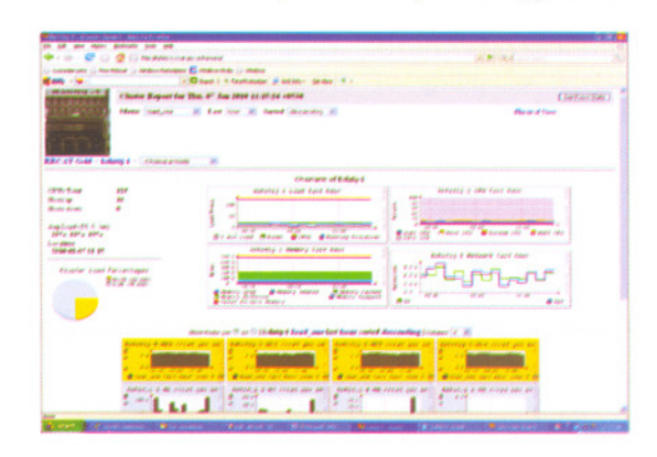
Fig. I.1.2: Monitoring of Kshitij-1.

configured along with compilers like Intel Fortran and C, GNU Fortran and C for sequential and parallel applications.