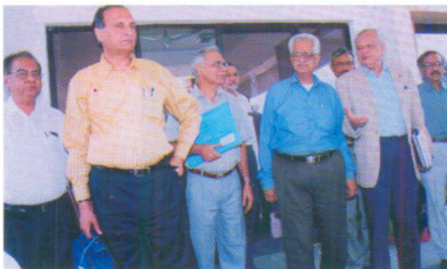
Members of the SAC-PM visiting CAT Laboratories