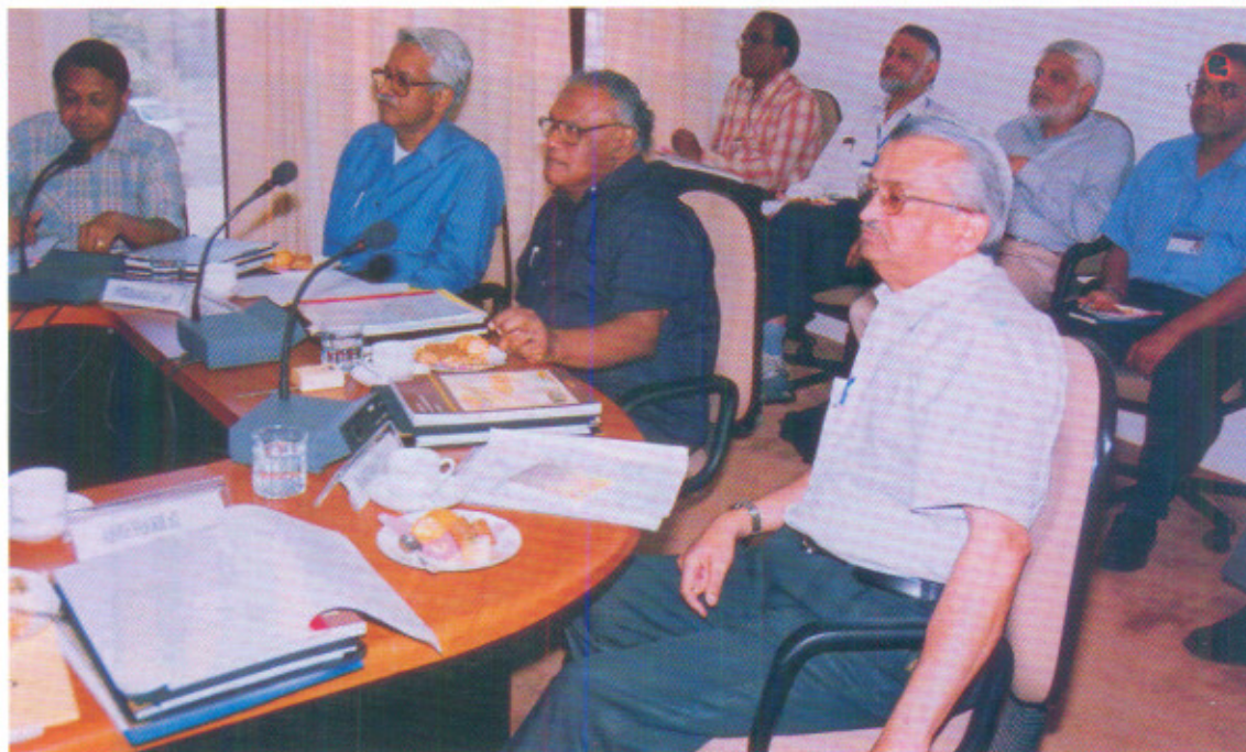
Dr. Anil Kakodkar, Chairman, AEC and Secretary, DAE and Prof. C.N.R. Rao, Chairman, SAC- PM during a discussion on the presentation by CAT scientists