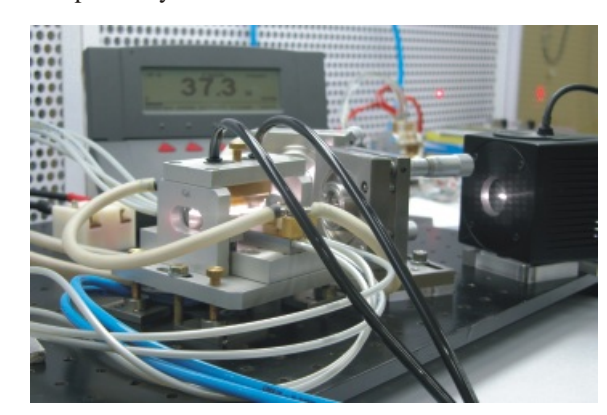
Fig. L.16.1 Photograph of the conduction cooled edge-pumped slab laser

dimension of the slab, the resonator is plane-plane and in the thickness dimension it is plano-concave. The HR coating on the slab served as folding mirror. Fig. L.16.1 shows the photograph of the system. The laser beam makes one diamond pattern with one bounce per surface. Optical-to-optical and slope efficiencies for both the resonator setups are 20% and 26% respectively.