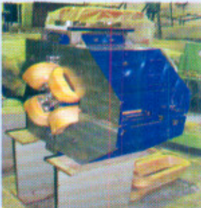
Fig. A.5.1 Open- type quadrupole magnet assembly

The pole tip profile was machined to finish by wire-EDM. The excitation coils were made using a semi-automatic coil-winding machine. The wound coils were consolidated with vacuum pressure impregnation followed by epoxy encapsulation for ground insulation. All open type quadrupole magnet cores and coils have been made successfully and the variation in magnet core geometries are within \pm\,0.05 mm. The variation in the electrical parameters among the coils is within 3%. Few magnet assemblies (assembly of magnet core with coils) were completed and the balance magnet-assembly work is in progress.