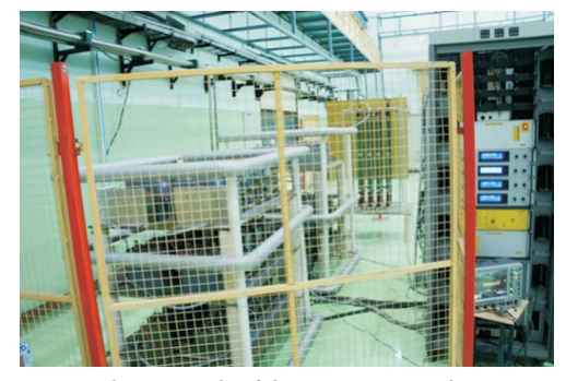
Fig. A.5.2: Photograph of the experimental setup.

The corrector unit compensates the overall droop in the main Marx unit. It is composed of 24 corrector modules. The corrector module is a lower voltage version of main module and operates at 1 kV. The corrector modules are charged to a lower voltage and are bypassed at the starting of the pulse. As the pulse progresses, there is droop in the output pulse. When the output pulse drops below an acceptable value of droop, first corrector module is added to the main Marx unit by turning ON its discharging IGBT and so on.