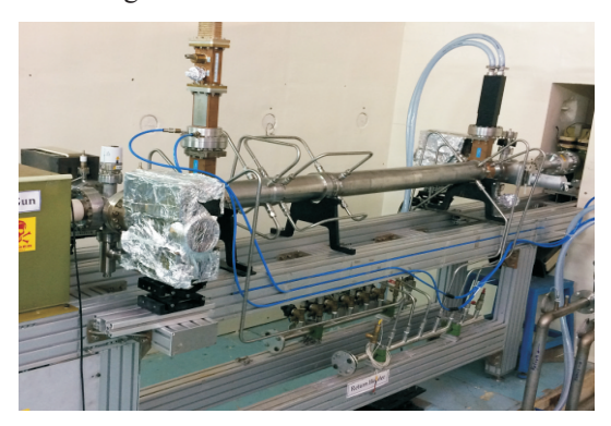
Fig. A.1.1: Linac-B1 assembled at ARPF.

RRCAT has completed development of two 10 MeV, 5 kW S-band electron linacs for radiation processing applications. These linacs will be used at the agricultural radiation processing facility (ARPF) being developed at Devi Ahilya Bai Holkar Vegetable and Fruit Market, Indore. The first linac (Linac-B1), after completion of its endurance testing at RRCAT, has been shifted to ARPF. Subsequently, all its subsystems have been assembled and tested in standalone mode. The linac is ready for preliminary beam trials at ARPF as shown in Figures A.1.1 and A.1.2.