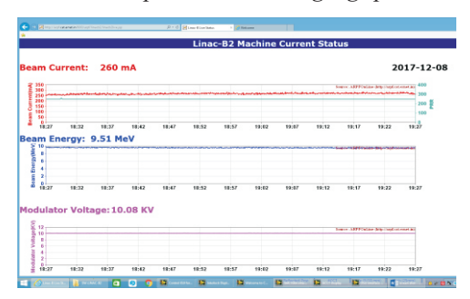
Fig. A.1.5: Linac-B2 parameters during endurance testing at 6 kW with non-stop operation for 8 hour shifts.