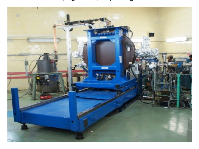
Fig. A.1.1: New 20 MeV injector microtron in Indus Accelerator Complex

A new 20 MeV injector microtron with improved features has been developed, tested and integrated as a new injector for Indus accelerators (Fig. A.1.1), replacing the old microtron.