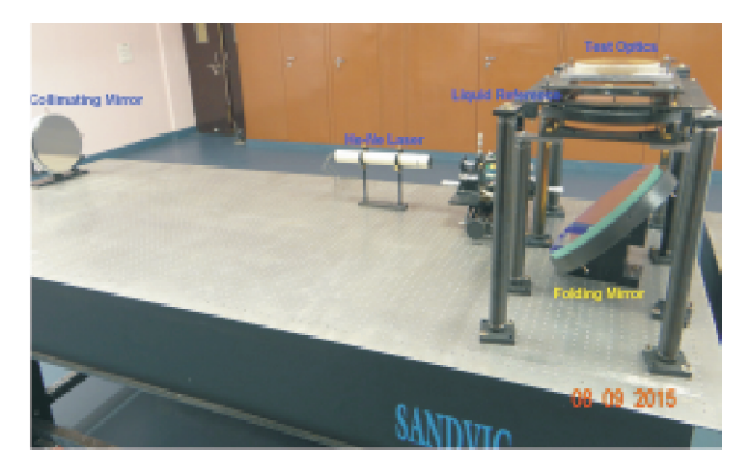
Fig. L.5.2: Photograph of the Liquid reference Fizeau interferometer

The photograph of the developed system is shown in Fig.L.5.2. The interferometer was constructed on a vibration isolation table to isolate external mechanical vibrations. The collimation of the expanded beam was checked using an inhouse fabricated 200.0 mm diameter wedge shear plate.